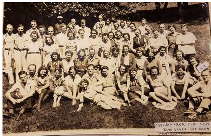
Cleveland Hiking Club, September 1940 at the dedication of the Oglebay Pool