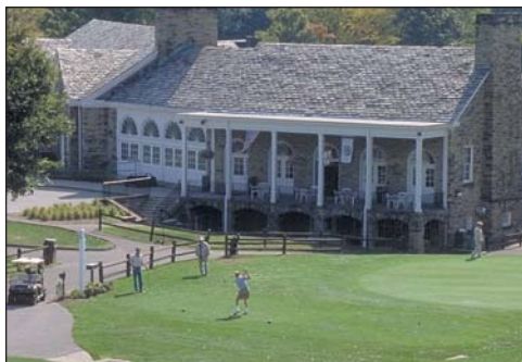
The Crispin Golf Course at Oglebay is more than 75 years old.

An endowment is created with the donation of a lump sum of money, either outright or through a planned giving vehicle. The principal is never touched, but the investment income goes to maintain the facility or program on an annual basis. Most facilities, sections within a facility, and recreation programs have endowment potential. The Oglebay