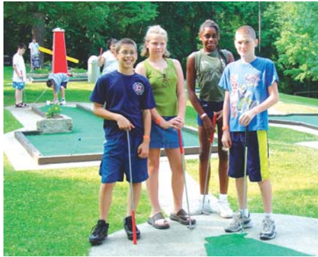
Last year almost 17,000 visits to the parks were made possible by the Access to the Parks program.

Unrestricted gifts are important because management and trustees can determine where the need is greatest and/or have matching funds available in order to obtain state or federal grants. You can, however, specify an area that you would like to support financially. In the past, contributions have benefited the gardens and the Access to the Parks program.