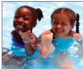
Thousands of youngsters participate annually in Access to the Parks, year-round.

improvements from the mid-forties through the seventies, including the first phases of Wilson Lodge, were made through gifts to the trust fund. It is gratifying to park officials that support from many families who funded projects through the trust fund has continued down through several generations.